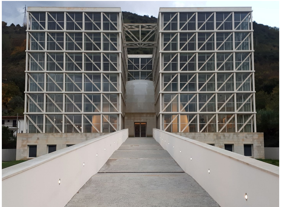
The planetarium 'G.B. Amico'.

Thus, the activities carried out at the planetarium are a direct result of the research that is produced in the Department of Physics. At the same time, school teachers and general users are encouraged to provide feedback to develop, improve and customize the activities to suit specific needs and demands. Consultation with school